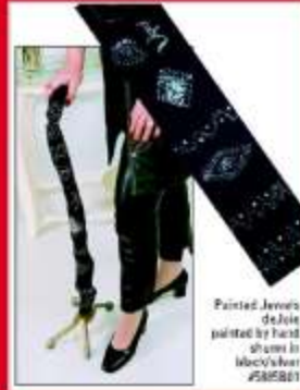
Painted Jewels deJolie painted by hand shown in black/silver #880801