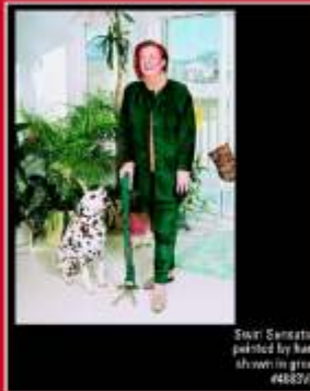
Sweet Sentations painted by hand shown in green #883914