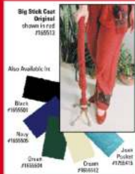
Big Stick Coat Original shown in red #155513