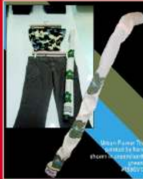
Urban Flower Top painted by hand shown in green/silver #880712