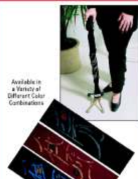
Available in a Variety of Different Color Combinations