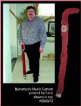
Benjamin's Men's Custom painted by hand shown in red #880413