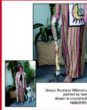
Unique Boutique Whimsical painted by hand shown in crimson/lt #8808112