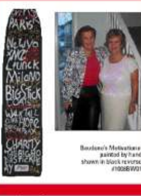
Benjamin's Motivational painted by hand shown in black reverse #1008101