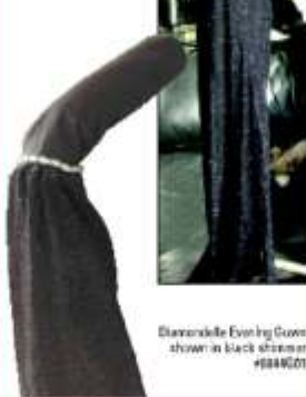
Diamondlike Evening Gown shown in black shimmer #884001