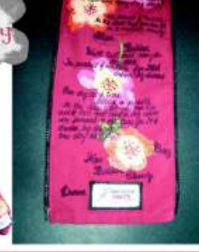
Bouqueted Flowers of Distraction painted by hand shown in red/lt #880413