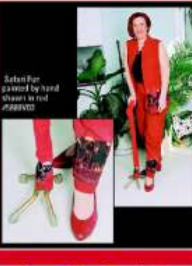
Safari Fun painted by hand shown in red #880403