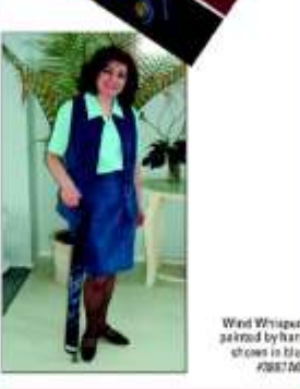
Wind Whispers shown in blue #8837105